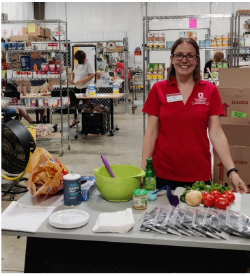
OSU Extension's Nutrition Classes