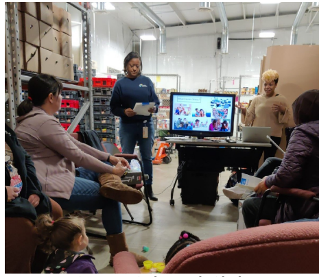
Nationwide Children's Parenting Classes