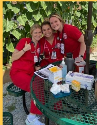
Ohio School of Nursing

He also manages our utility assistance program .