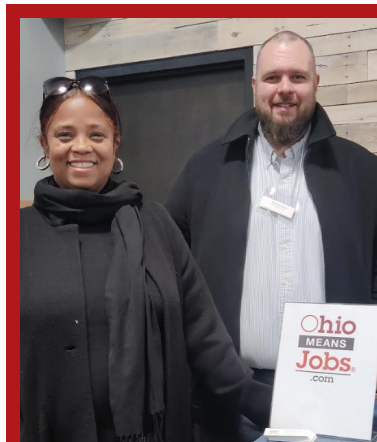
Ohio Means Jobs